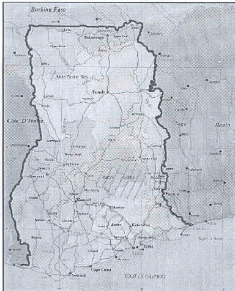
Regional Map of Ghana

The administrative system in Ghana has profound implications for the organization and management of the health sector, especially within the pluralistic paradigm of health and health-related service delivery. It represents considerable opportunities for intersectoral collaboration and action at all levels as well as the monitoring and supervision of programs targeted for the benefit of the poor and vulnerable in society. This opportunity has not been adequately explored and utilized in the past. The focus at the district level will require a major re-orientation and capacity building within the health sector and among stakeholders.